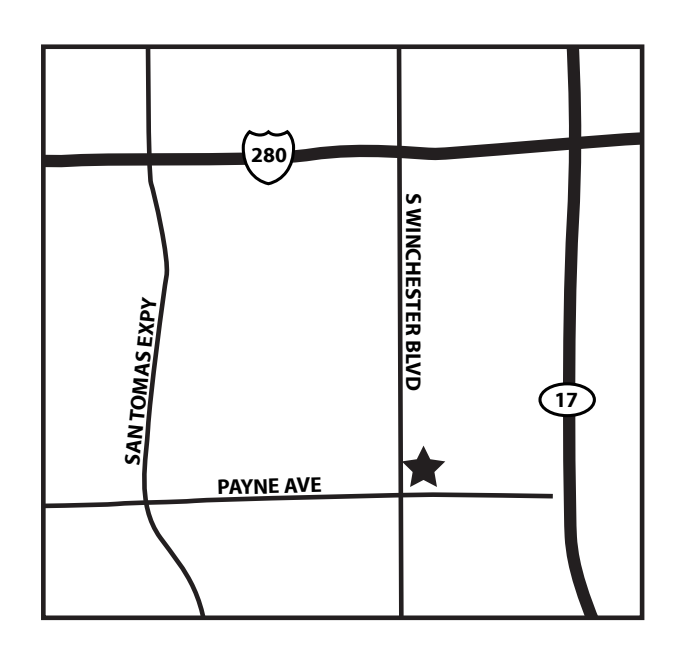
Ear Associates & Rehabilitation Services 3071 Payne Avenue San Jose, CA 95128